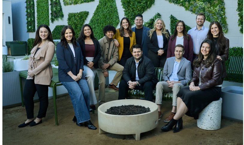
2025 Leadership Council

Metro EDGE inspires and emboldens its members to drive the culture, development and amenities that will brand Sacramento as THE place for young professionals to live, work, and play.